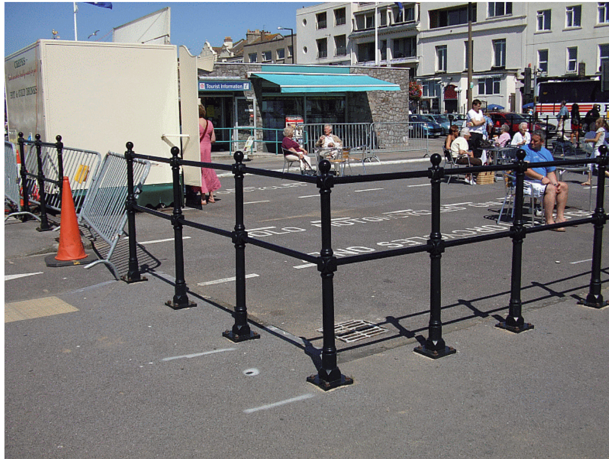
A Demented Troll Production

To add insult to injury the Bike Park was used for a fast food outlet!