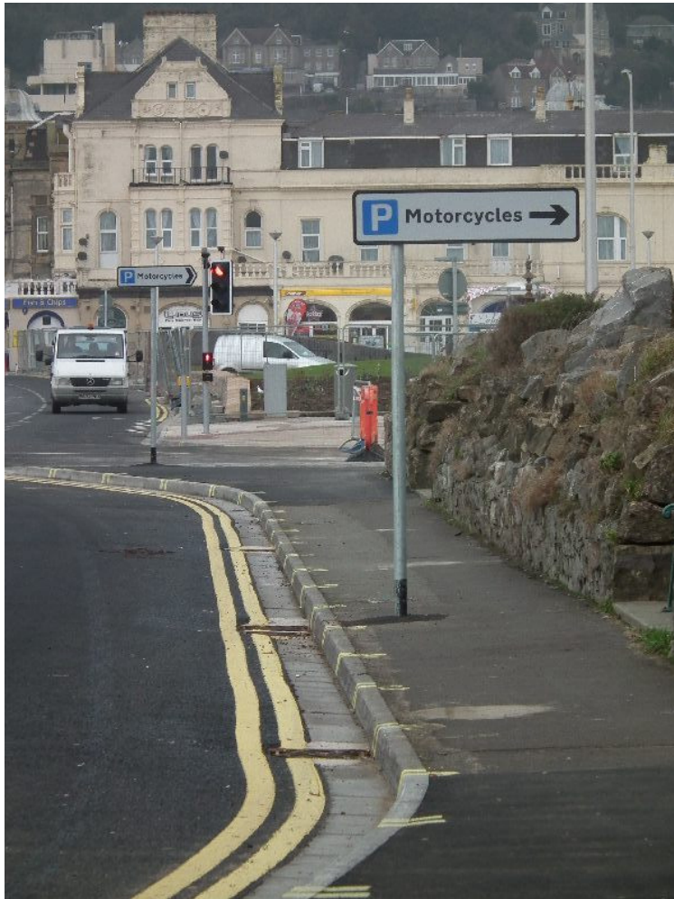
The bike park is signed off of Marine Parade

Heavy brick paving has been used, also the barriers are of a type to allow bikes to be shackled to the cross bars